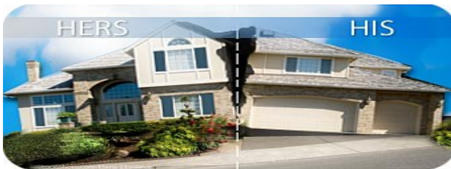
What's yours is yours, or is it?

What this means is that "what's yours is yours and what's mine is mine." In a Divorce, if something is characterized as Separate Property, a court does not have the power to divide it or to give it to a soon to be ex-spouse. But this begs the question, "how do you know what's yours?" The answer is, "your Separate Property is yours."